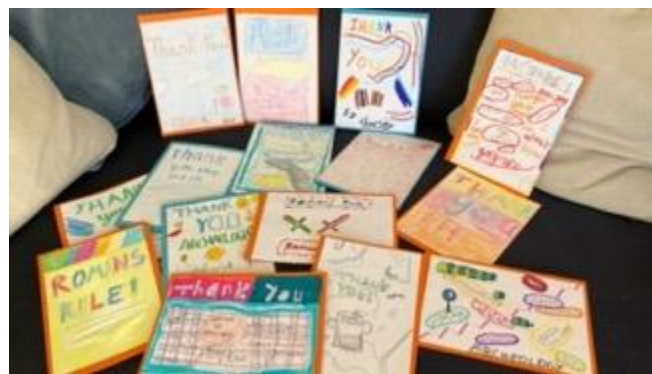
Figure 3: Thankyou cards created by the students of St Nicolas C of E Primary School.

about the tools that archaeologists use to carry out excavations and surveys. The image below shows a selection of the thankyou cards created by the children in appreciation of the BAS presentations.