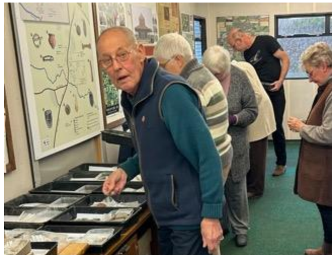
Figure 1: Members of The Marcham Society engaged in Level 2 sorting

digitised, uploaded onto the BAS shared drive and made available to members wanting to participate in post-excavation analysis. Specialist analysis of glass, clay pipes, coins and animal bone have been completed, and specialist analysis of stone, iron objects, iron slag, CBM, worked flints and pottery are well underway. Analysis of the pottery assemblage is the most significant element of the current work with 3591 sherds in the process of being identified, with 75% now having completed 'Level 2' fabric identification. To date 73 BAS members have taken part in the post-excavation analysis, and there is plenty of work still to complete if you would like to get involved.